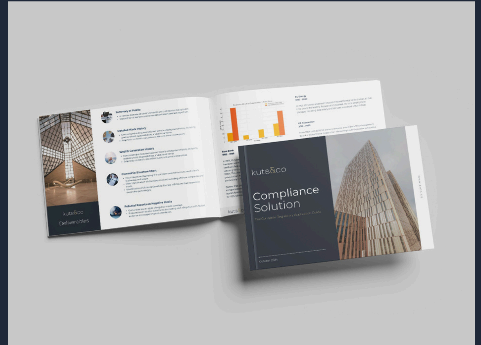
Structured Compliance & Regulatory Solution