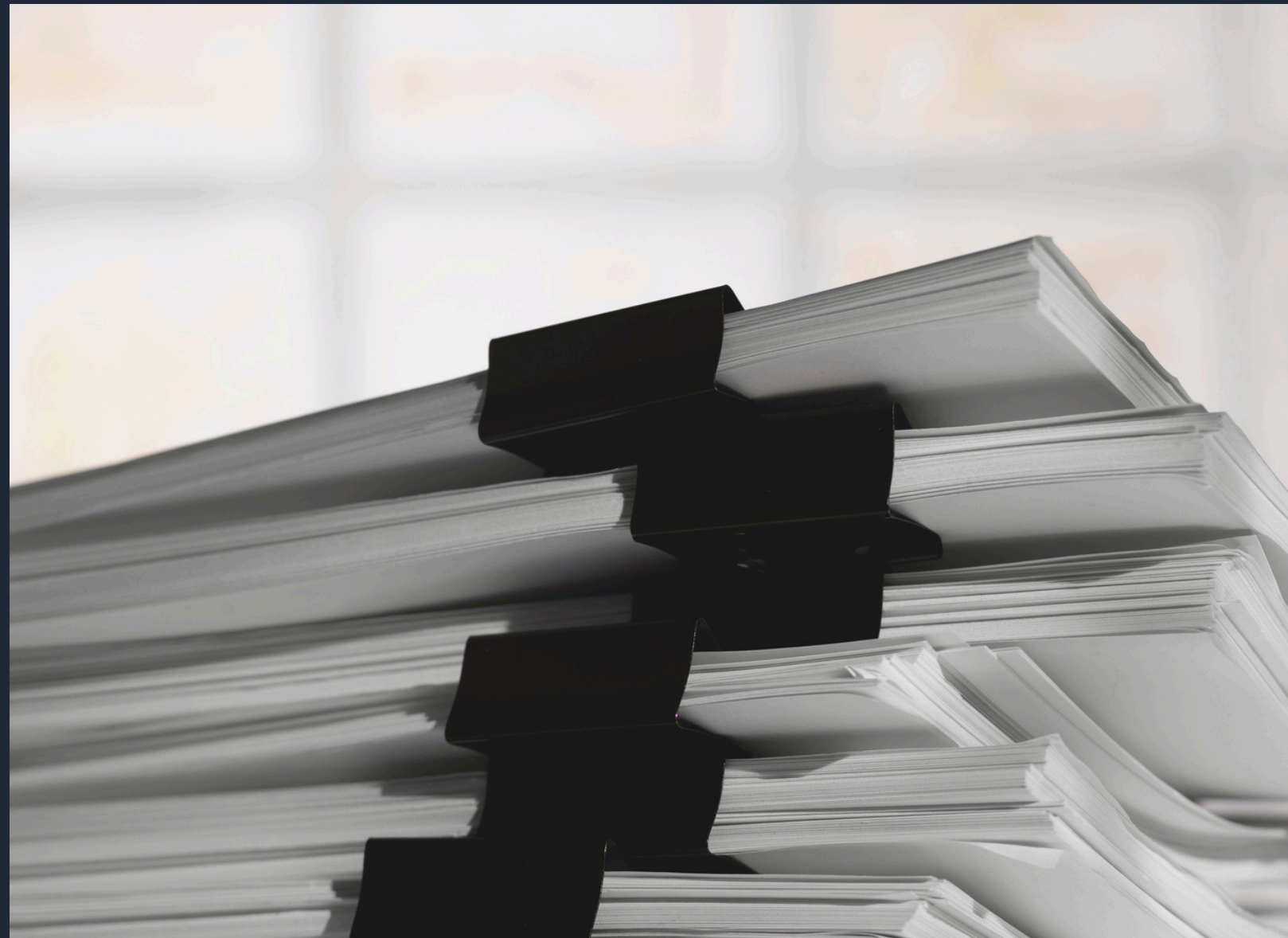
Extensive Paperwork & Delays

Based on the preliminary assessment, we will develop and deliver a personal compliance profile in accordance with the international standards in the form of a detailed, perfectly structured and illustrated presentation report in English and other required languages accompanied by all necessary supporting documentation.